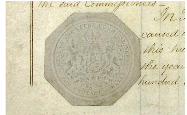
Tithe Commissioners' Official Seal