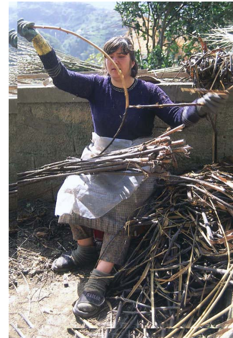
The preparation of Withies