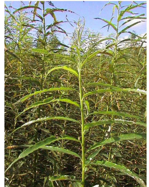
Osier Willow ( Salix viminalis )