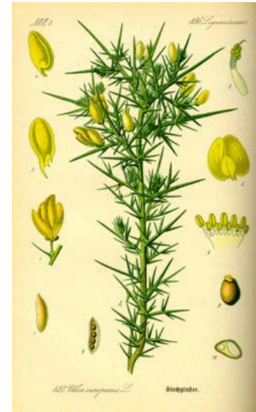
Common Gorse ( Ulex europaeus )