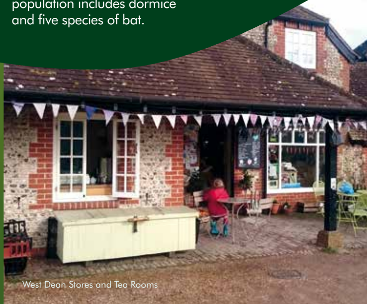
West Dean Stores and Tea Rooms

Common blue butterflies can be spotted on the route