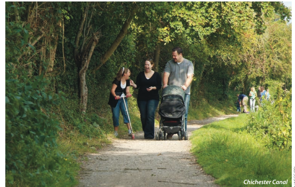
Chichester Canal