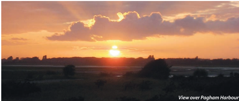
View over Pagham Harbour