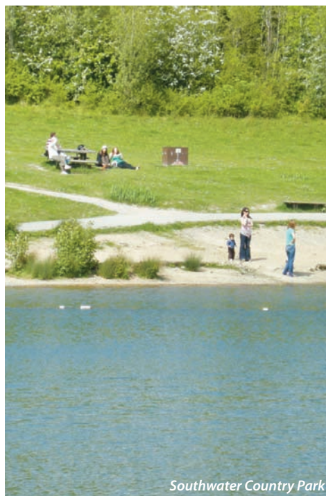
Southwater Country Park

Nestled in the heart of Southwater Village, this 70 acre Country Park, with its three lakes, species rich grassland, easy access paths and range of facilities is a very appealing spot. Cripplegate Lake is the focal point of the Park. The slightly undulating path follows the perimeter of the lake and can be followed in either direction around the lake. The reed beds, sloping grasslands, pockets of coppice and mature woodland make this busy park a haven for wildlife such as lizards, kingfishers, butterflies and dragonflies. There is seating at various locations around the lake and at the far end there is a large open area of grassland overlooking the lake which is great for a picnic.