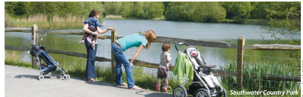
Southwater Country Park