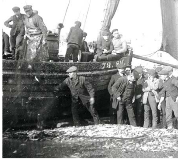
© West Sussex County Council Library Service [N058344]