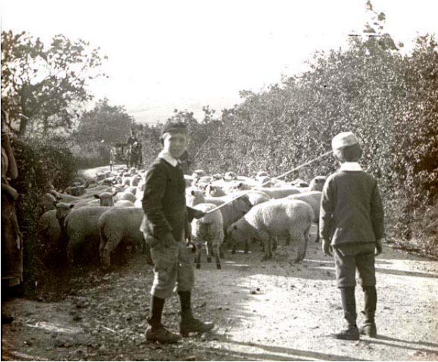
© West Sussex County Council Library Service [N057991]