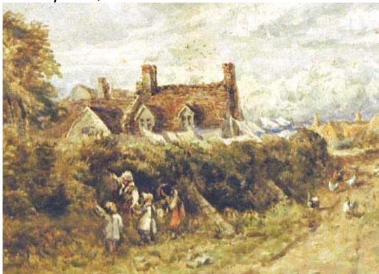
© Worthing Museum and Art Gallery, watercolour by David Cox