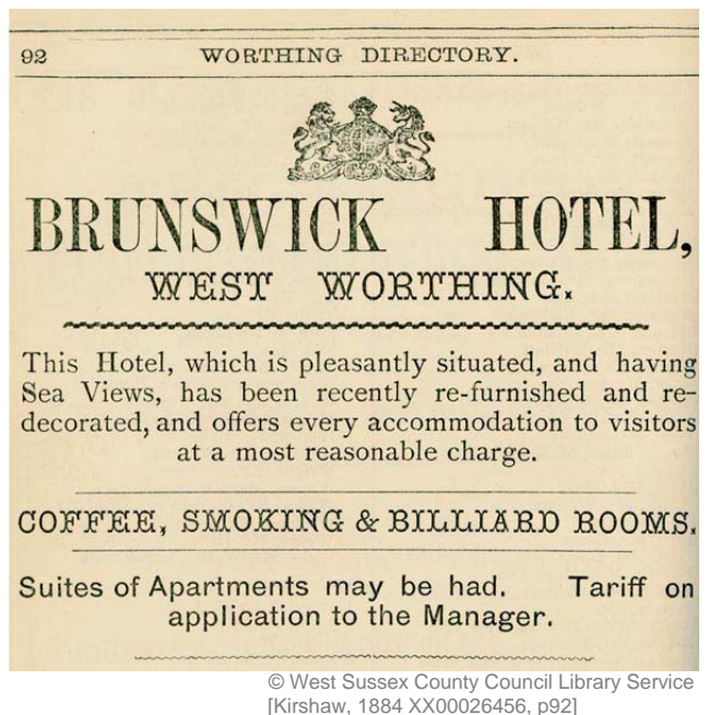
Source 9. Advertisement for Brunswick Hotel, Worthing, 1884