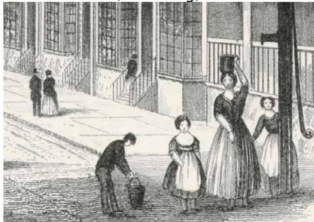
© West Sussex County Council Library Service [E000149]