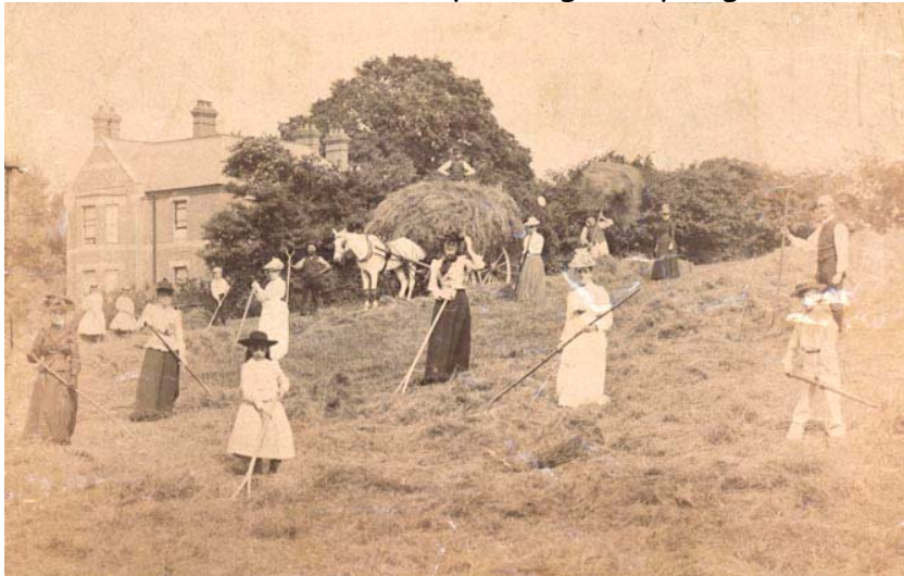
Source 11. Farm workers haymaking, Steyning, c1900