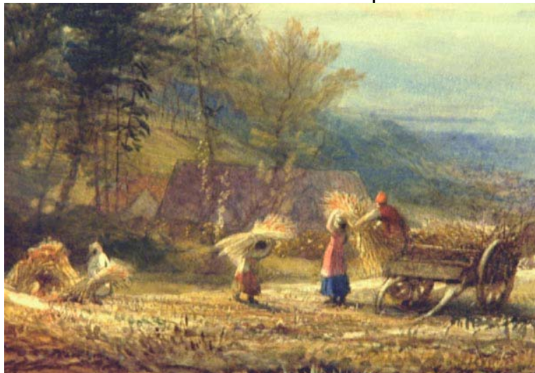
Source 12. Women and children help with the harvest, c1846

watercolour by Samuel Palmer