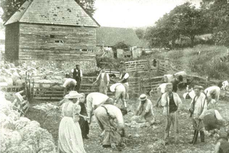
Source 10. Farm workers shearing sheep at Saddlescombe, 1890