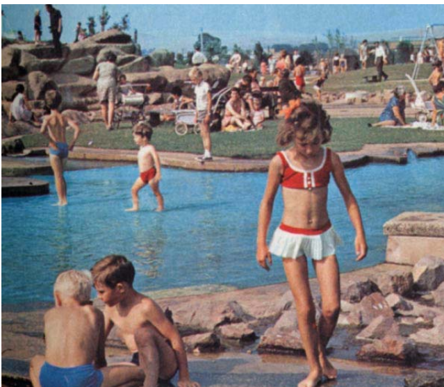
11. Holidaymakers on the beach, East Wittering, c1960

© West Sussex County Council Library Service [BOOK_WORTHINGGUIDE_1970_15]