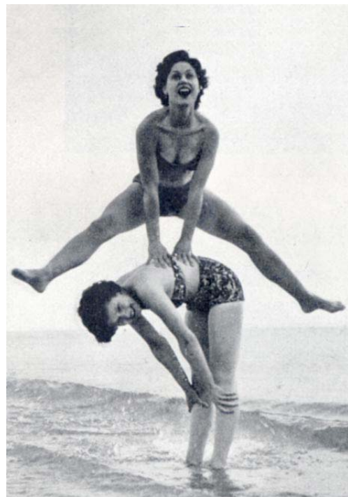
9. Children paddle in the sea, Worthing, c1952,

© West Sussex County Council Library Service [BOOK_WORTHINGGUIDE_1955_08]