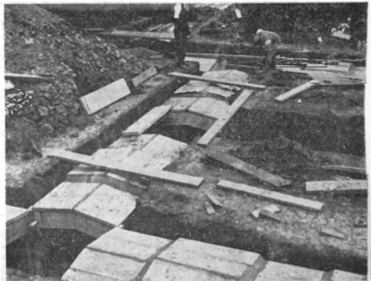
AIR RAID SHELTER in Steyne-gardens in course of construction.