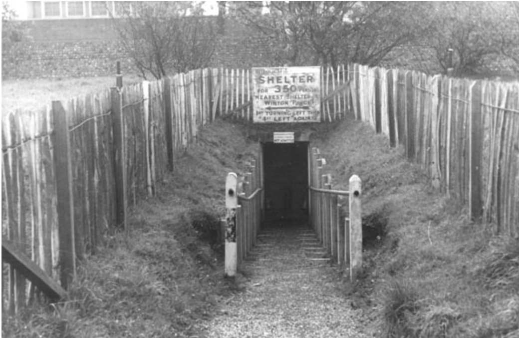
© West Sussex County Council Library Service Walter Gardiner Photography Collection [WGP000036]

Entrance to shelter in Stoke Abbot Road, Worthing