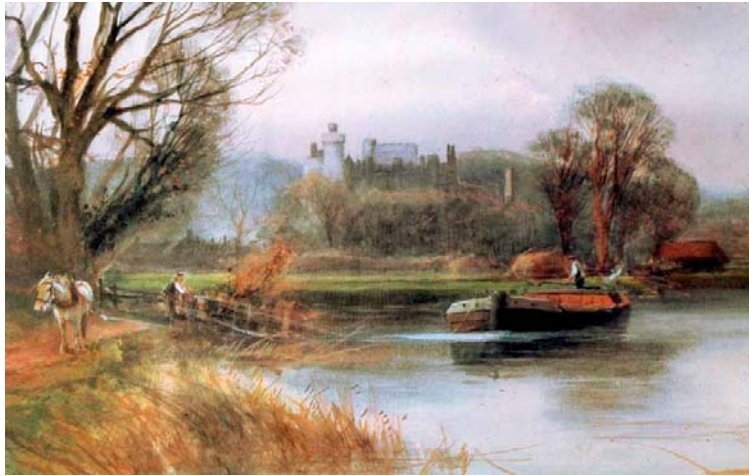
© West Sussex County Council Library Service/P.A.L.Vine [PB0002a]