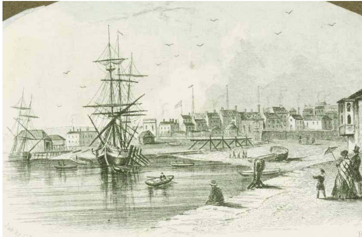
© West Sussex County Council Library Service [E000140]