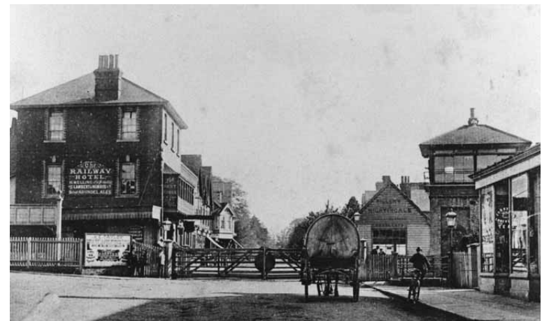
© West Sussex County Council Library Service [P002319]