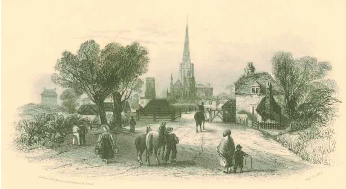
© West Sussex County Council Library Service [E000060]