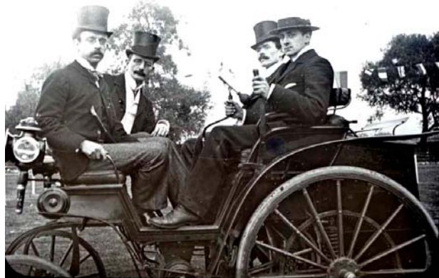
© West Sussex County Council Library Service [N057959]