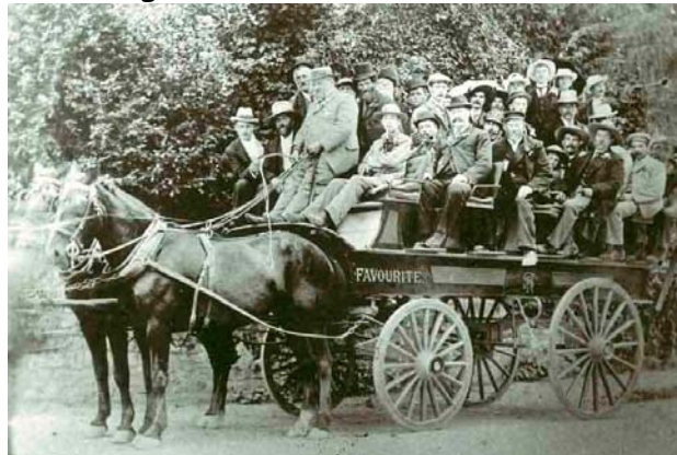
© West Sussex County Council Library Service [P002750]