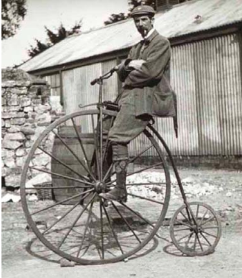
West Sussex County Council Library Service [N058032]