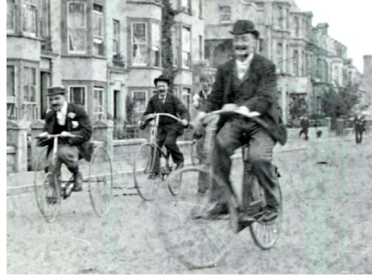
© West Sussex County Council Library Service [N058290]