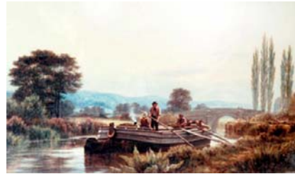
14. Barge at Fittleworth Wharf, 1865