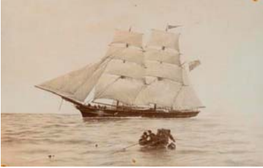
9. Sailing ship off Shoreham-by-sea, c1860