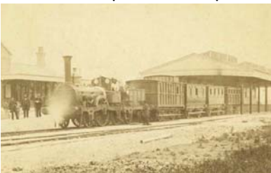
15. Passenger train with steam locomotive, Barnham, 1864