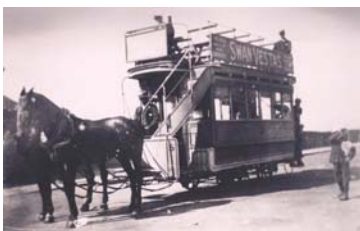
5. Horse-drawn tram, Shoreham-by-Sea, c1895