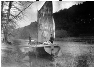
7. Sailing barge, Fittleworth, c1885