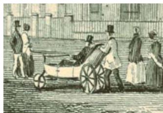
6. Bath-chair on Worthing beach, 1849