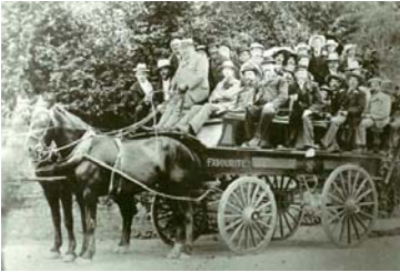
11. Horse-drawn brake, Worthing, c1890