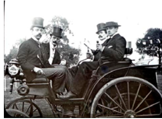
10. Motor car, Worthing, c1890