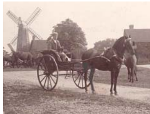
4. Horse-drawn gig, Wisborough Green, 1896