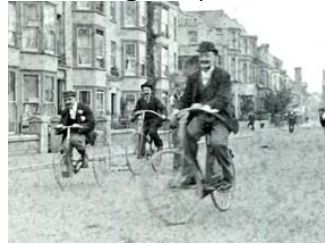
12. Men riding bicycles, Worthing, c1900