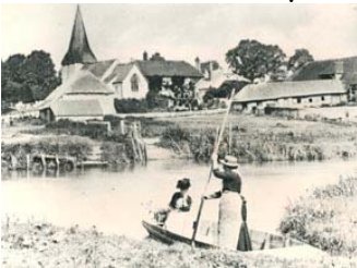
13. Ferrywoman and passenger on River Arun at Bury, c1900