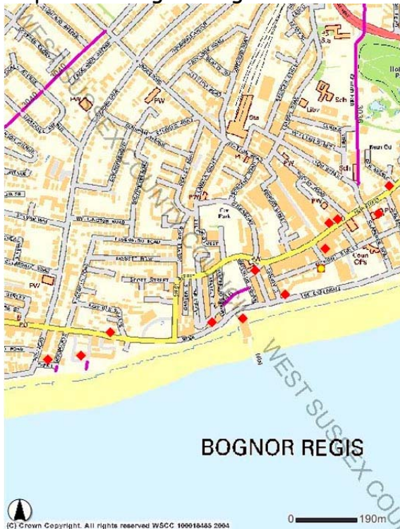
Map of the Bognor Regis Town Trail

Note: These maps are extracts from the West Sussex County Council Interactive Map (iMap) and are copyright of the Ordnance Survey. They may be used in the classroom but must not be reproduced for any other purpose.