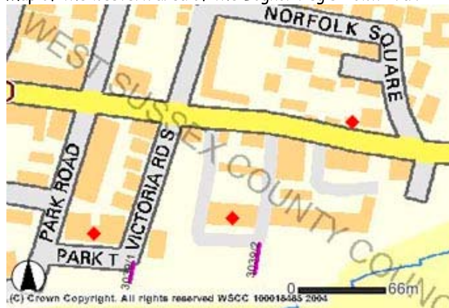
Map of the western area of the Bognor Regis Town Trail