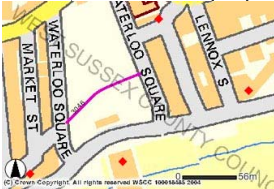
Source 13c. Map of the central area of the Bognor Regis Town Trail