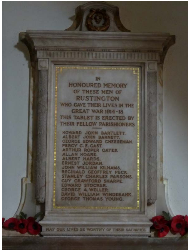
The Plaque in St Peter and St Paul's church