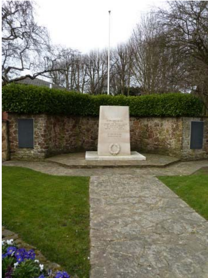
The Memorial located in "The Street" Rustington