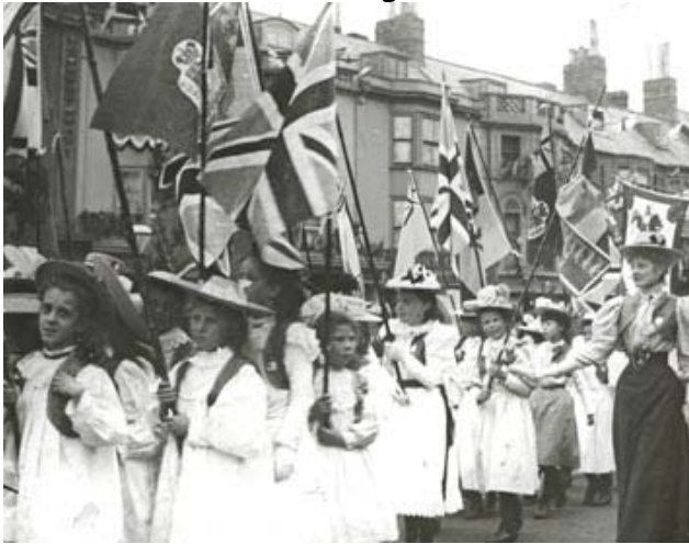
© West Sussex County Council Library Service [N057547]