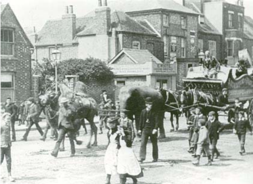
© West Sussex County Council Library Service [P000667]

Circus parade at Southgate, Chichester, 1895