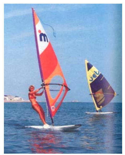
[BOOK_WORTHINGGUIDE_1984_04] 11. Windsurfing at Worthing beach, c1984