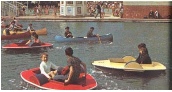
© West Sussex County Council Library Service [BOOK_WORTHINGGUIDE_1972-14]

9.Boating on the sea, Littlehampton, c1975