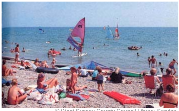
© West Sussex County Council Library Service [BOOK_WORTHINGGUIDE_1984_18]