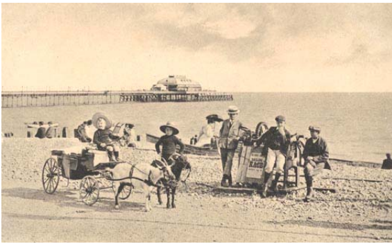
© West Sussex County Council Library Service [PC008431]