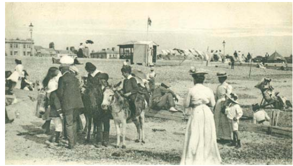
© West Sussex County Council Library Service PC005504]