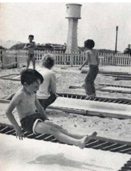
11. Children bounce on trampolines, Littlehampton, c1979