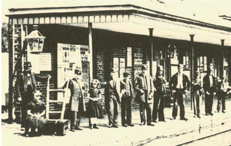
© West Sussex County Council Library Service [P002755]