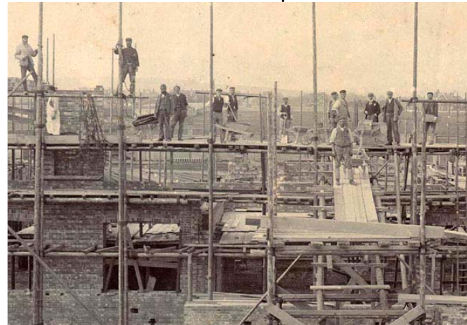
© West Sussex County Council Library Service [KJP009]