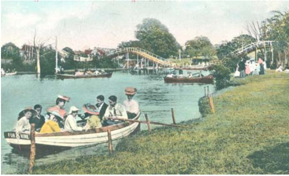
© West Sussex County Council Library Service [PC002344]