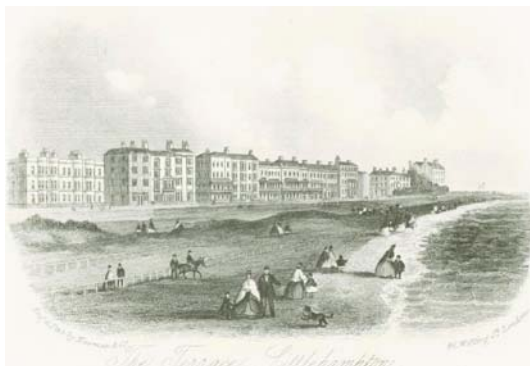
© West Sussex County Council Library Service [E000138]

5. Seaside visitors, Littlehampton, c1850