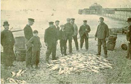
© West Sussex County Council Library Service [TC000011B]

1. Fishermen sell their catch on the beach, Worthing, c1900