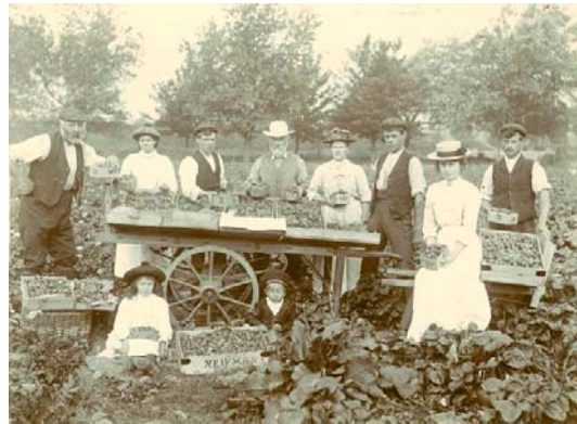
© West Sussex County Council Library Service [P002762]

4. Market gardening family, Worthing, c1895