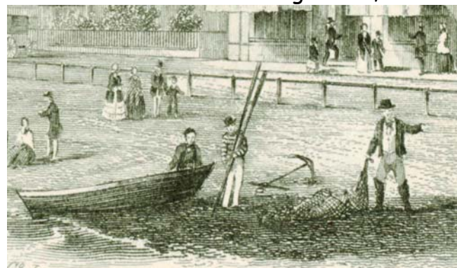
© West Sussex County Council Library Service [N057989]