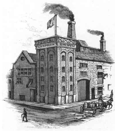
West Sussex County Council Library Service [ISBN E300090617]