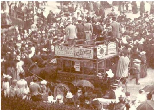
© West Sussex County Council Library Service [P002742]