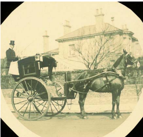
© West Sussex County Council Library Service [P002751]

Source 7. A hansom cab in Worthing, c1900