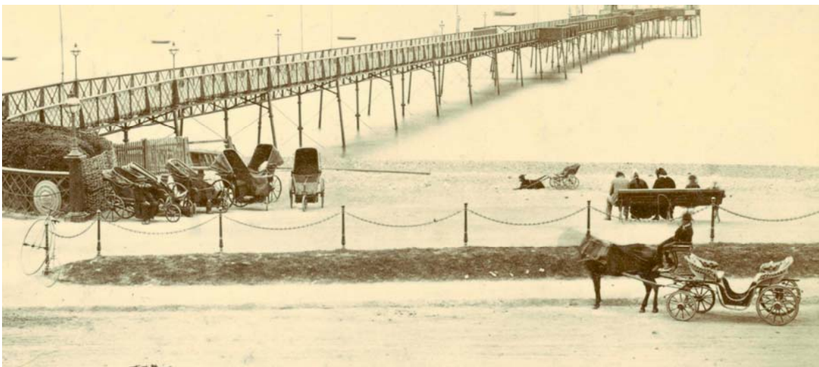
© West Sussex County Council Library Service [P002743]