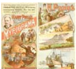
Source 2. Pamphlet advertising 'Harry Poole's Myriorama' at the Theatre Royal, Worthing, 1897