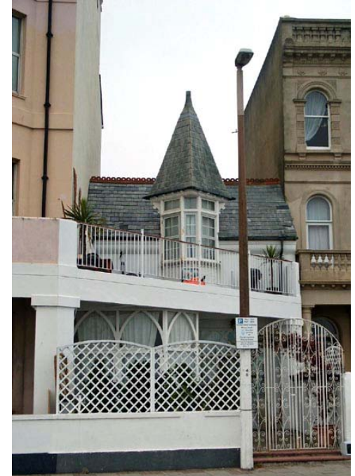
Views of the south side of the house.

34. Victorian pillar box, near Holy Trinity, Shelley Road, 2005