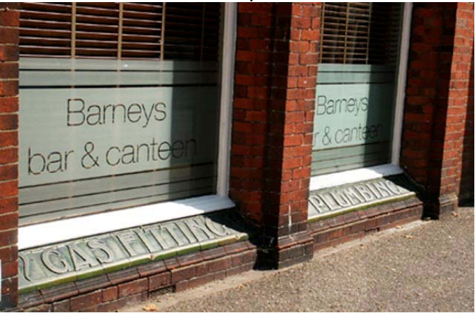
Close view of part of the west side of the building.