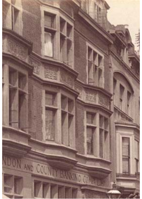
32b. South Street 1895, close view of a building on the west side.