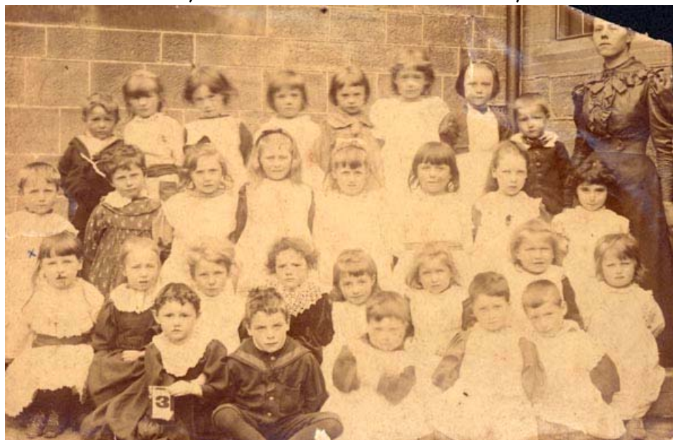
© East Grinstead Town Museum [EGRTM2372.6]