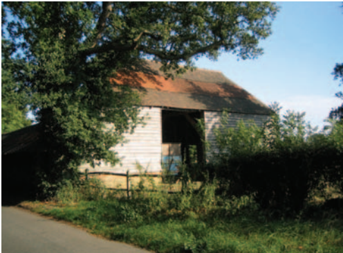
Pellings Barn, Hurstpierpoint