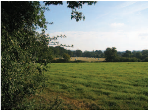
View south to Cobbsmill