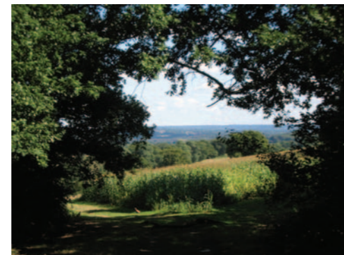
Ouse Valley from Slough Green