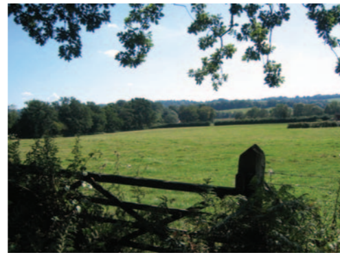
Ouse Valley, Staplefield