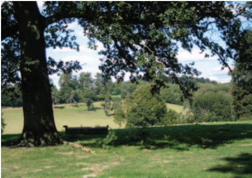
St Leonards Forest