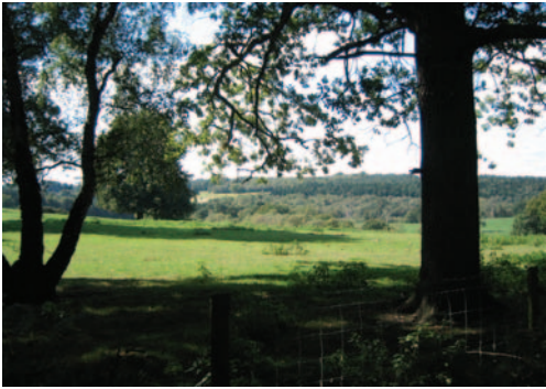
St Leonards Forest