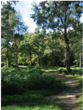
Cowdray Forest, Balcombe