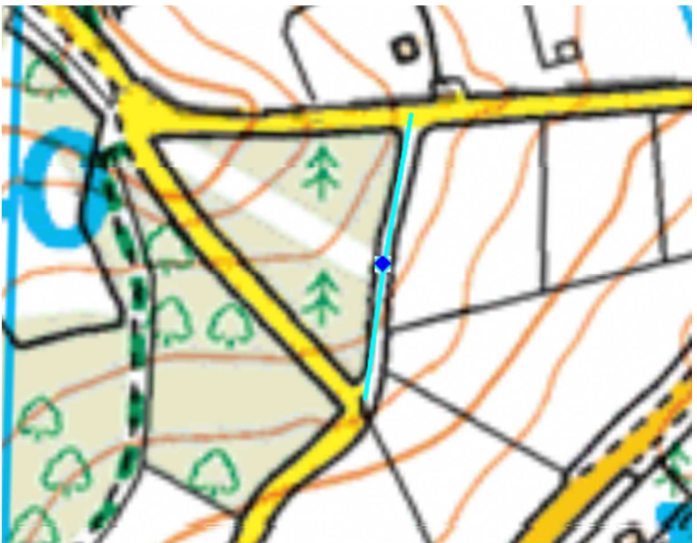
Taken from an OS explorer map at 1-25000 and enlarged.